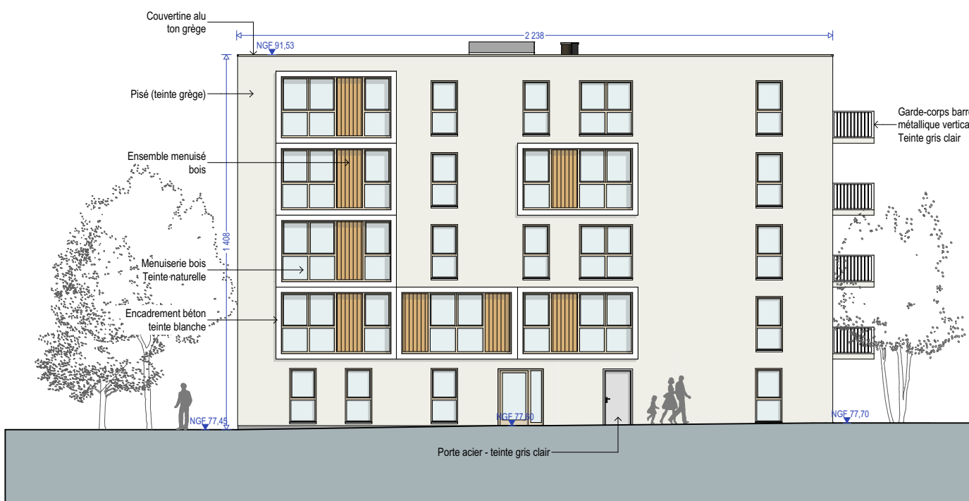
FC-E1 - Façade Est #1